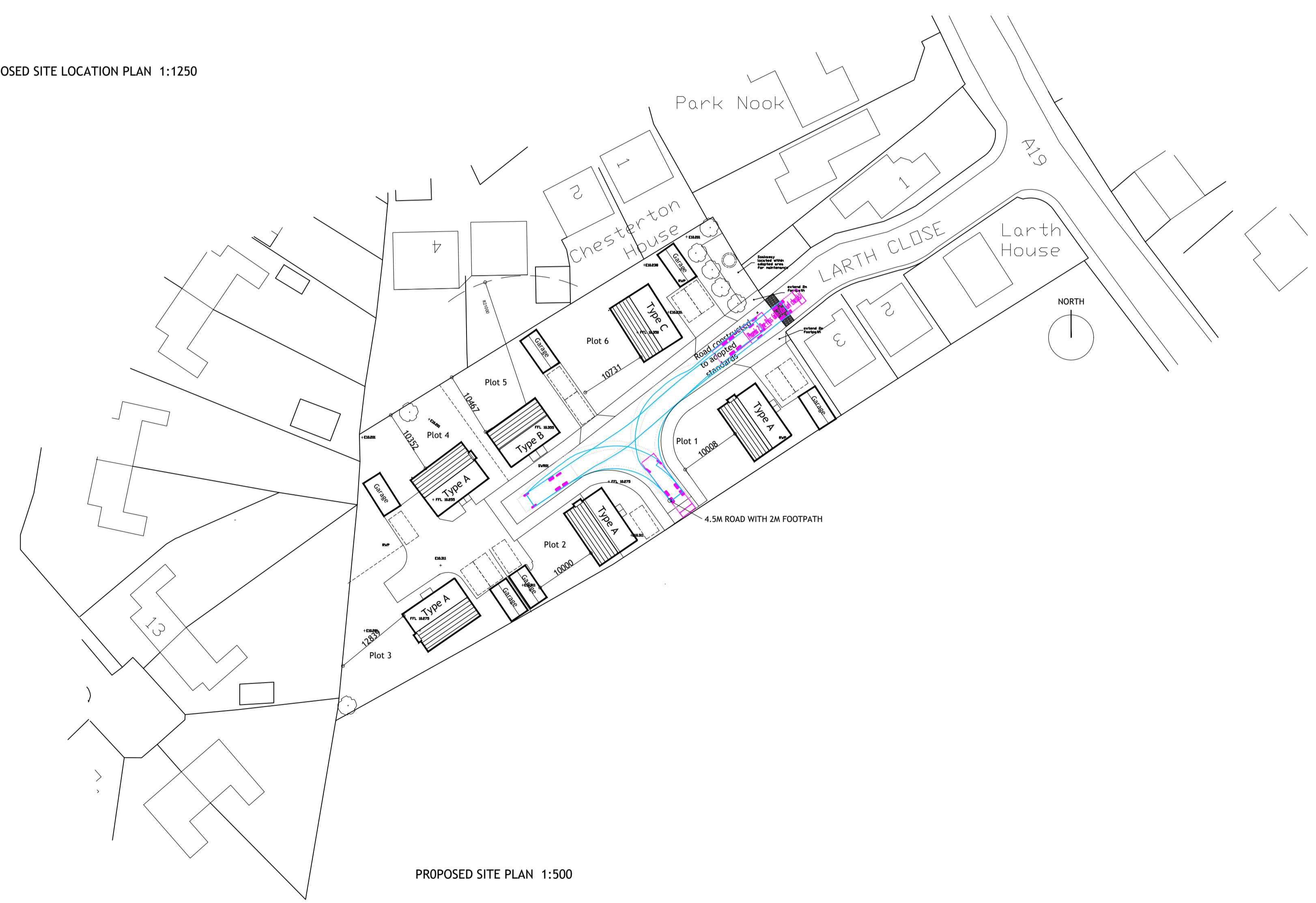
PROPOSED SITE PLAN 1:500